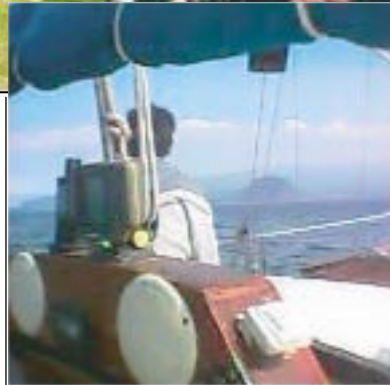
The view off Oshima