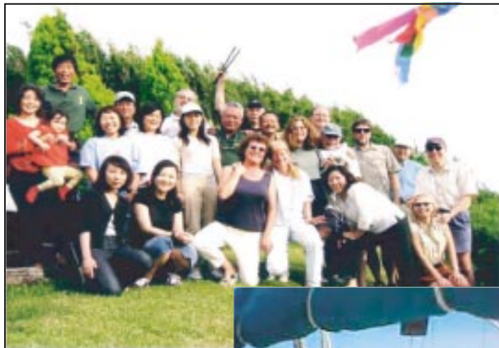
Our annual seaside rendezvous in Misaki